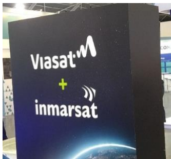
Display of "Viasat + inmarsat" at the Viasat booth