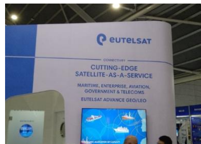
Eutelsat booth display showing the words: "Eutelsat Advance GEO/LEO"