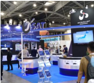
SKY Perfect JSAT's exhibition booth