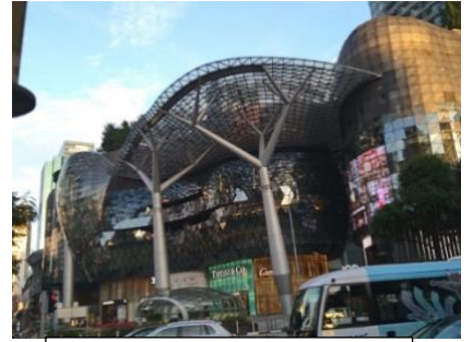
Main shopping spot: ION Orchard

Last year, I stayed in the riverside area here, where restaurants and wine bars line the river, but this time, I stayed in the Orchard Road area, which is the heart of retail in central Singapore. Only in this central area can convenience be so high, with great access and shopping, etc., but one thing to be aware of is that hotels are small and expensive.